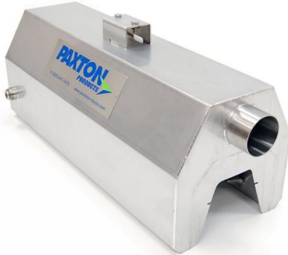
Figure 2: Commonly used Paxton cap dryer system. Silgan recommends this or a similar style system for effective moisture removal.